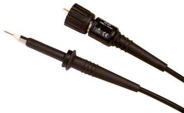
Model 6551 Microline Passive Oscilloscope Probe with Readout Actuator